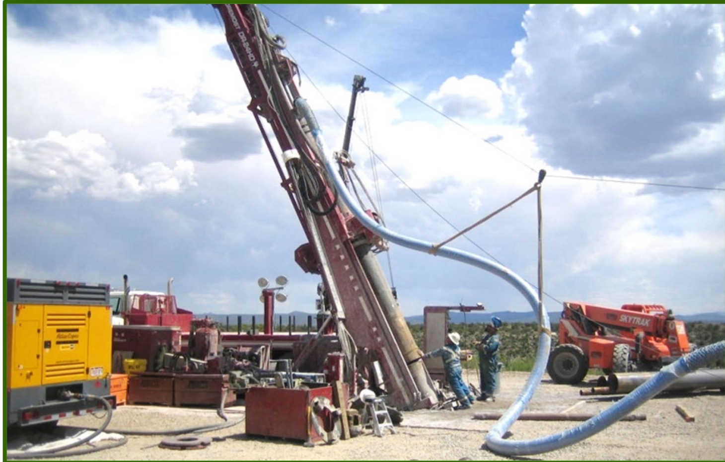
Drilling angled injection well for Interim Measure