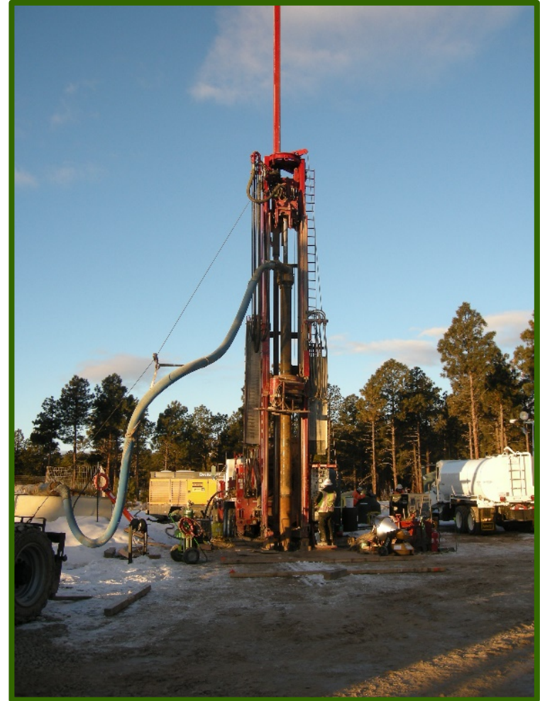
Regional well R-68 under construction