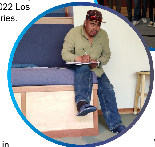
On-the-job literacy training by Literacy Volunteers of Santa Fe

Our $5,000 contribution to Literacy Volunteers of Santa Fe (LVSF) supported the work of tutors from the Adult Education Department of Santa Fe Community College. They provided English as a Second Language training to 40 individuals on 12 worksites in 2022. LVSF tutors worked with them while they were on the job (with the permission of their employers) to improve their English reading, writing and speaking skills. Thanks to this instruction, the employees will be better prepared to advance within their companies and in their careers.