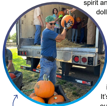
• Fundraiser for the Los Alamos Public School Choir

N3B and our parent companies view our Community Commitment program and employee volunteerism as an important opportunity to enhance the lives of individuals, families and communities in the Northern New Mexico region. Individually and as an organization, we're investing our time, spirit and creativity, as well as our dollars, in this effort.