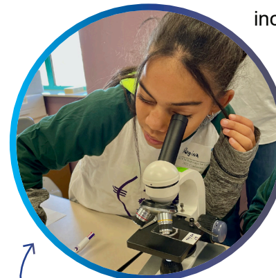
Students engaged in STEM Santa Fe program

In 2022, N3B contributed to a variety of groups in four broad categories: Education, Health & Human Services, Arts & Culture and Civic & Economic Development . Some funding highlights include: