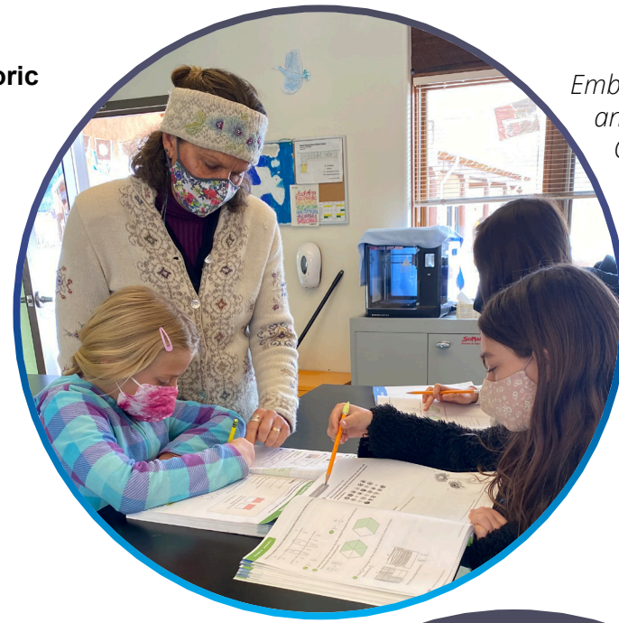
Embudo Valley Library and Community Center tutoring program sponsored by United Way of Northern New Mexico

6 boards supported by members of N3B's senior management