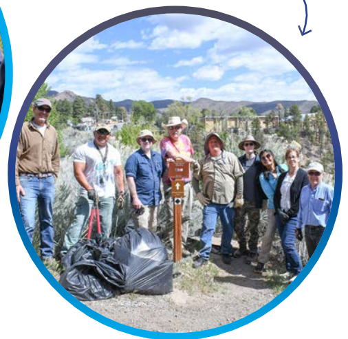
Maintaining the N3B-adopted Los Alamos County Trail