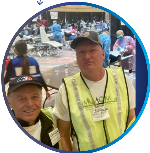
NM Mission of Mercy Dental Clinic