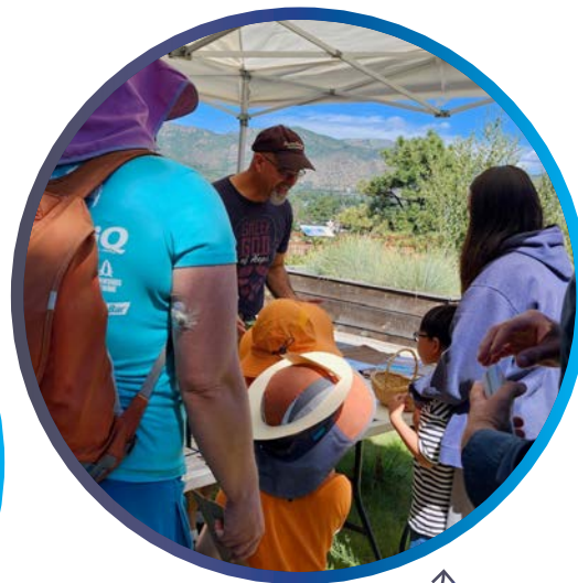
The PEEC Bear Festival