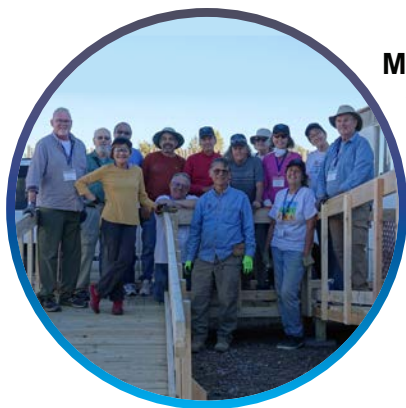
Volunteers for Mesa to Mesa built ramps for residents across Northern New Mexico with supplies purchased through a grant from N3B

Mesa to Mesa is a nonprofit organization bringing together volunteers to improve the health, safety and security of low-income homeowners in Northern New Mexico through minor home repairs and home maintenance education. A grant from N3B enabled the organization to purchase supplies to build ramps for residents with mobility issues.