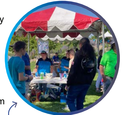
N3B’s “Edible Aquifer” hands-on craft provided a learning experience for children at the Los Alamos ScienceFest 2024

N3B was a proud sponsor of Los Alamos ScienceFest 2024 , celebrating the history and science of Los Alamos through fun activities and events for people of all ages over five days in July. During Discovery Day at Ashley Pond Park, N3B team members hosted a children’s education exhibit, “The Edible Aquifer,” which illustrated the complexities of sediment layers and underground aquifers using layers of candy and other sweet treats.